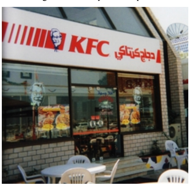
The local cuisine is often not what it is cracked up to be

"Travel is glamorous only in retrospect" -- Paul Theroux