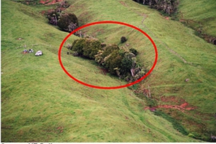
Figure 2 Location of ZK-HTF Closer View.

"Being in a ship is being in a jail, with the chance of being drowned." -- Samuel Johnson